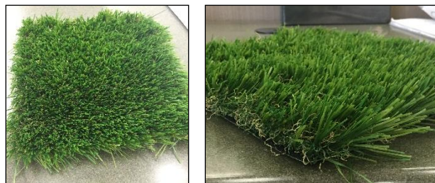
Examples of acceptable artificial turf