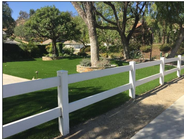
Example of installed artificial turf

*See Model Water Efficient Landscape Ordinance Guidelines for additional information and requirements.